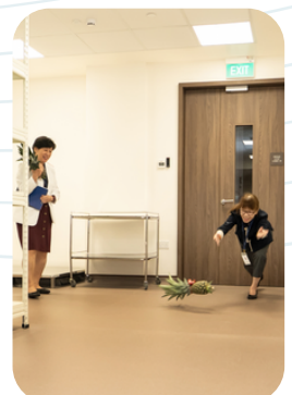
Blessing of the new area