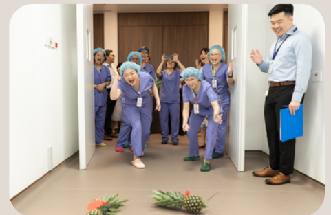
Blessing of the new area