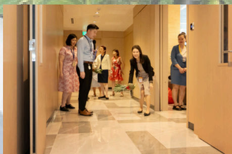
Celebration with staff