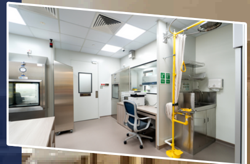
Admixture Clean Room