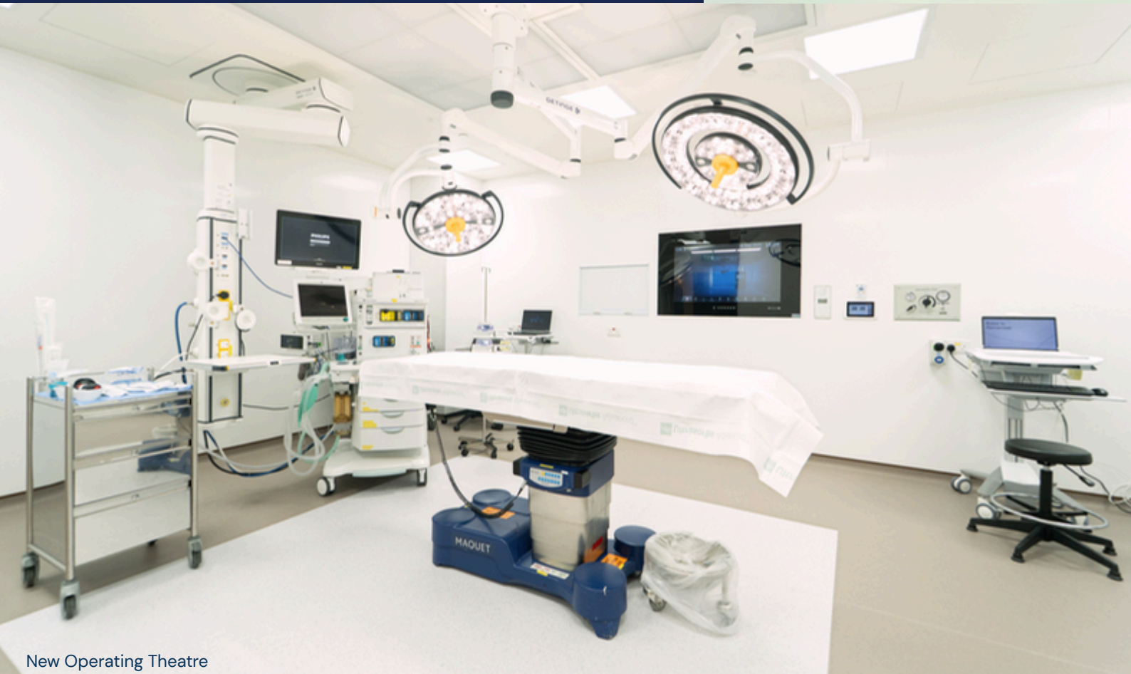
New Operating Theatre