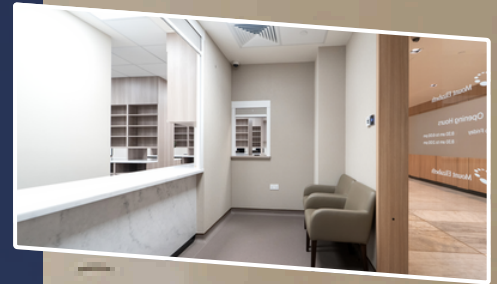
Pharmacy Service Counter