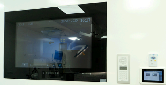
OT touchscreen control panel