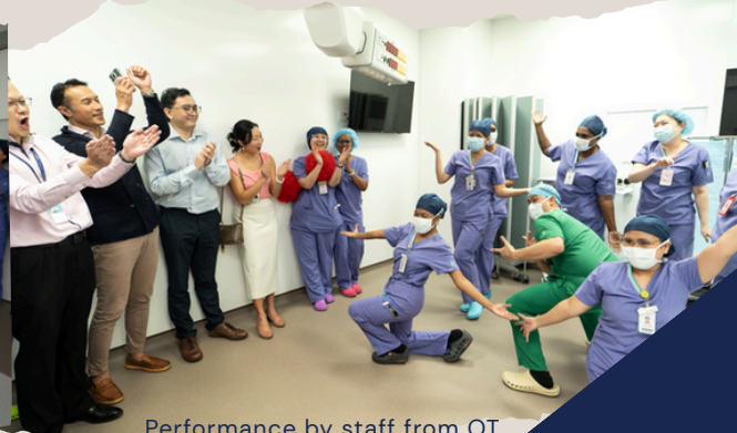
Performance by staff from OT